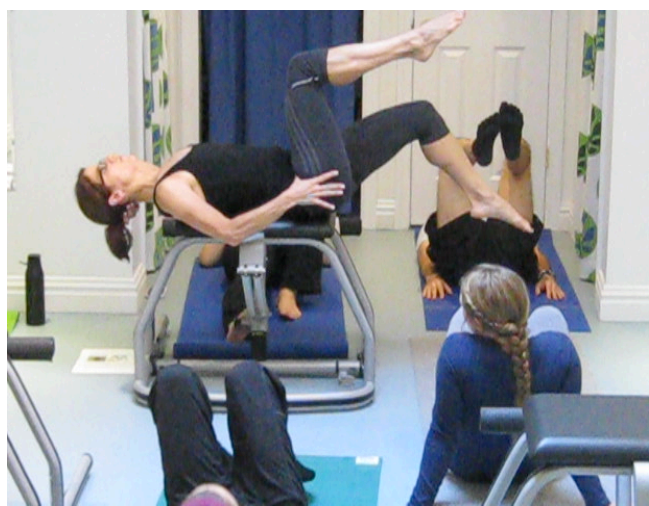
Expert Demonstration of Pilates Exercises

Whether you plan on becoming an instructor yourself or simply wish to deepen your understanding of Pilates, these trainings will transform your body and your mind.